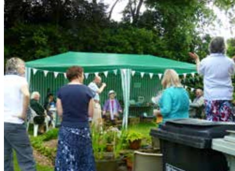
The Rectory is a four-bedroomed house with attractive garden, nearest to St Michael's church.