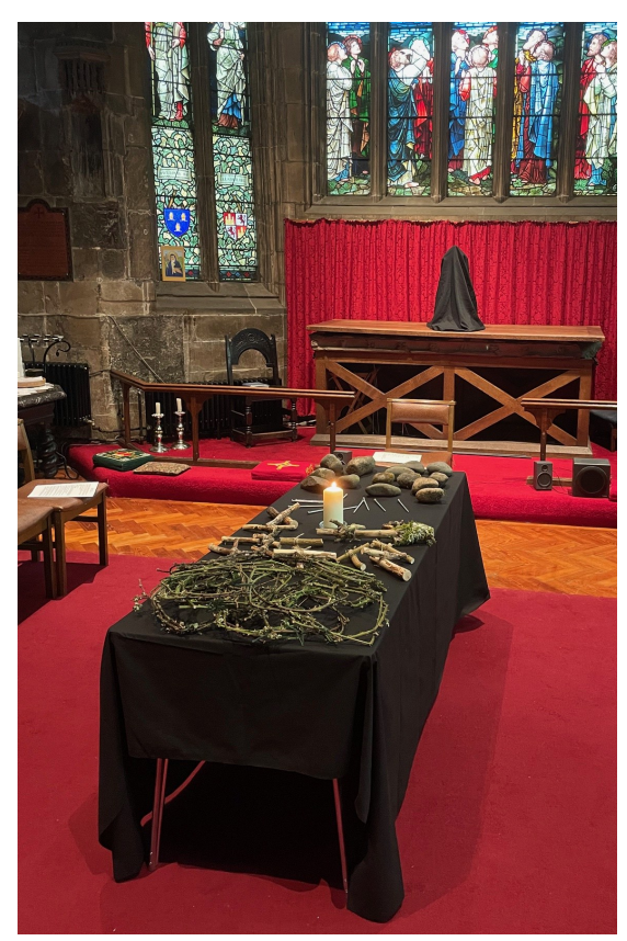
Good Friday Contemplative Service: the table set up with crowns of thorns, wooden crosses, nails, and pebbles to represent our sin

Between 35 and 40 people came along, most for the full two-hours, and some for one hour.