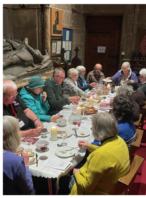
The sharing of the 'Agape Meal'