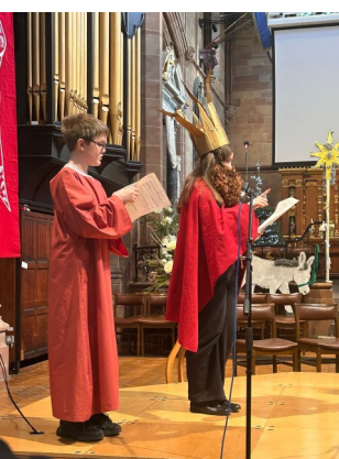
The cast members gradually gather around the manger: He came for us all